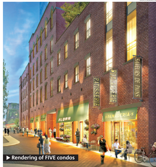
► Rendering of FIVE condos

The heritage restoration is being conducted by the award-winning ERA Architects Inc., in conjunction with Hariri Pontarini Archi-