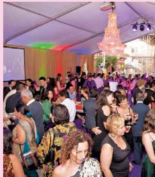
Lavish galas that combine TIFF and condo development are the latest trend.

9 Mill Street • Monday - Friday: 12pm - 6pm • Weekends: 12pm - 5pm