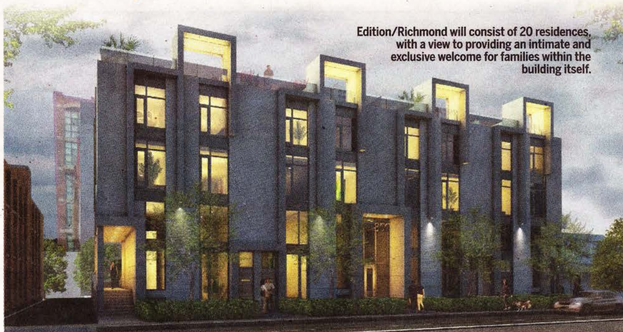
Edition/Richmond will consist of 20 residences, with a view to providing an intimate and exclusive welcome for families within the building itself.

They were confident about their purchase as they've had a positive experience with the builder previously. "We bought with the devel-