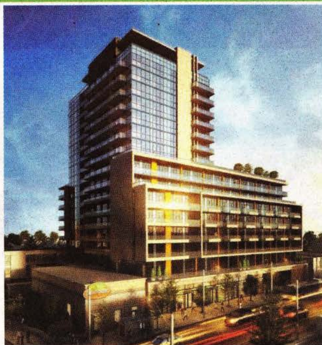
Empire Communities is launching a new condominium project along the Eglinton West corridor. The HUB will rise 16 storeys at the corner of Oakwood and Eglinton Ave.

At ground level, the façade is brought right to the street giving a unique experience to retail tenants and residents in