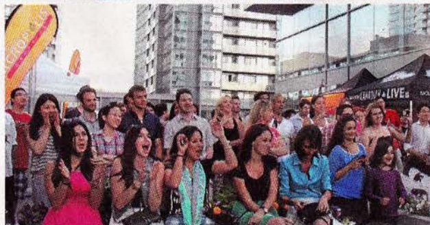
On Saturday, August 17th, Cityfest will bring thousands of residents and visitors together to celebrate community talent,