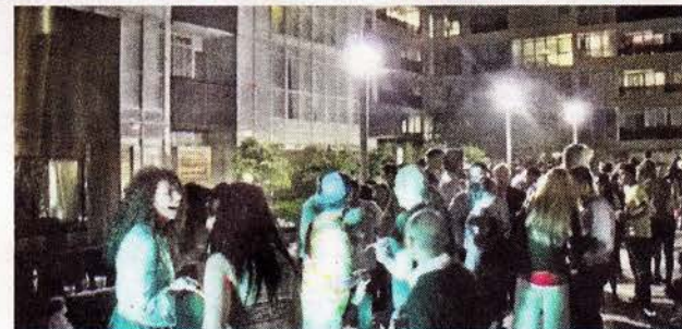
The festival's sounds and grooves will appeal to the young and hip residents of downtown Toronto but Cityfest is planned to be a family-friendly festival as well.

also managed to line up some impressive corporate sponsors. "We have over 20 sponsors who have made Cityfest possible." Molson Coors will be hosting a beer garden, Sobeys will set up a barbecue and the Raptors, Toronto FC, Porter Airlines and Z103.5 will be giving away goodies at the event.